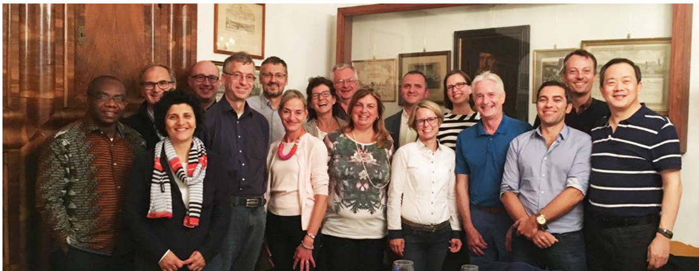
The Executive Board and the Board of Directors during a long day discussion meeting on the future directions of the society, the day before the annual GA meeting in Basel, Switzerland.