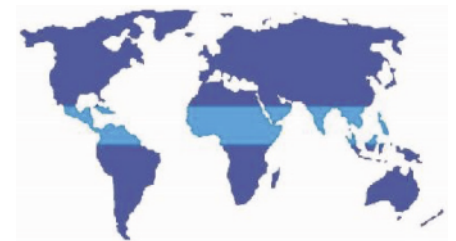
The Mycetoma Belt

Mycetoma has an uneven distribution in both tropical and subtropical regions. It is especially prevalent in a belt, stretching between the latitudes 15° South and 30° North which is known as “mycetoma belt”. The belt encompassing countries like Brazil, Chad, Ethiopia, India, Mexico, Senegal, Somalia, Sudan, and Yemen.