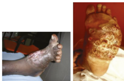
Massive foot mycetoma

eumycetoma, respectively. However, the clinical presentation of both types is almost identical irrespective of the causative organism. The infection is commonly spreading subcutaneously at a slow rate with no pain and could involve a number of secondary nodules which may suppurate and drain through multiple sinuses. Eventually it causes tissue destruction, deformity, disability and death in extreme cases.