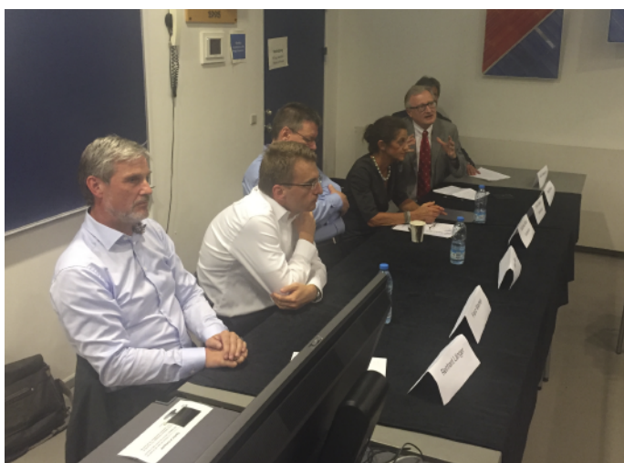
The discussion podium for the regulatory Affairs Workshop 2016.