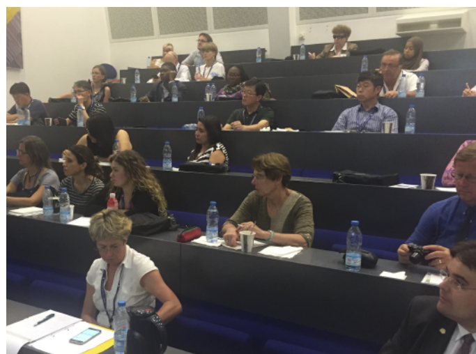
... and the auditorium ...