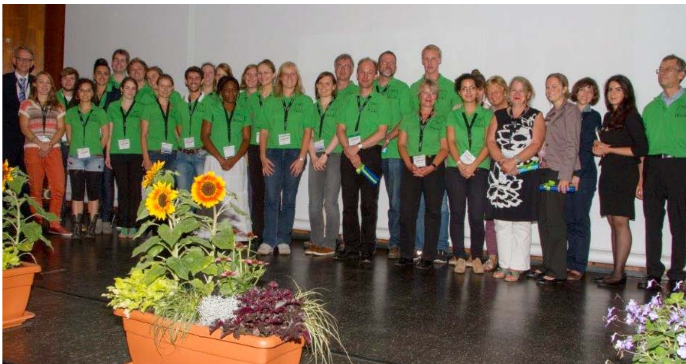
The congress GA 2013 organisation team.