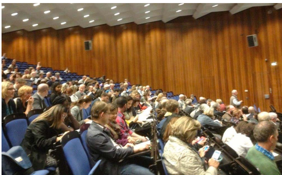
Main Lecture Hall for exciting talks and discussions.