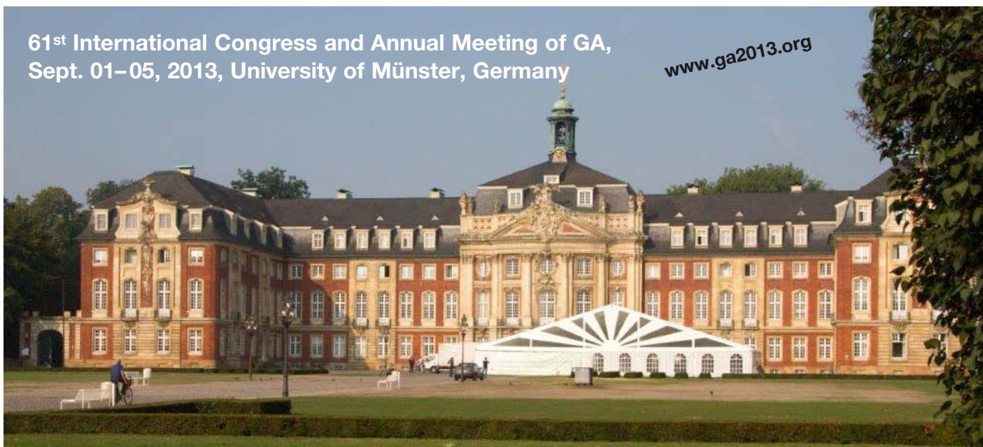
Münster castle and the GA-poster tent.